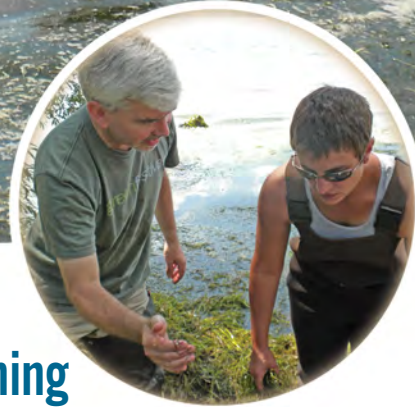
Seining for fish in the Niagara River