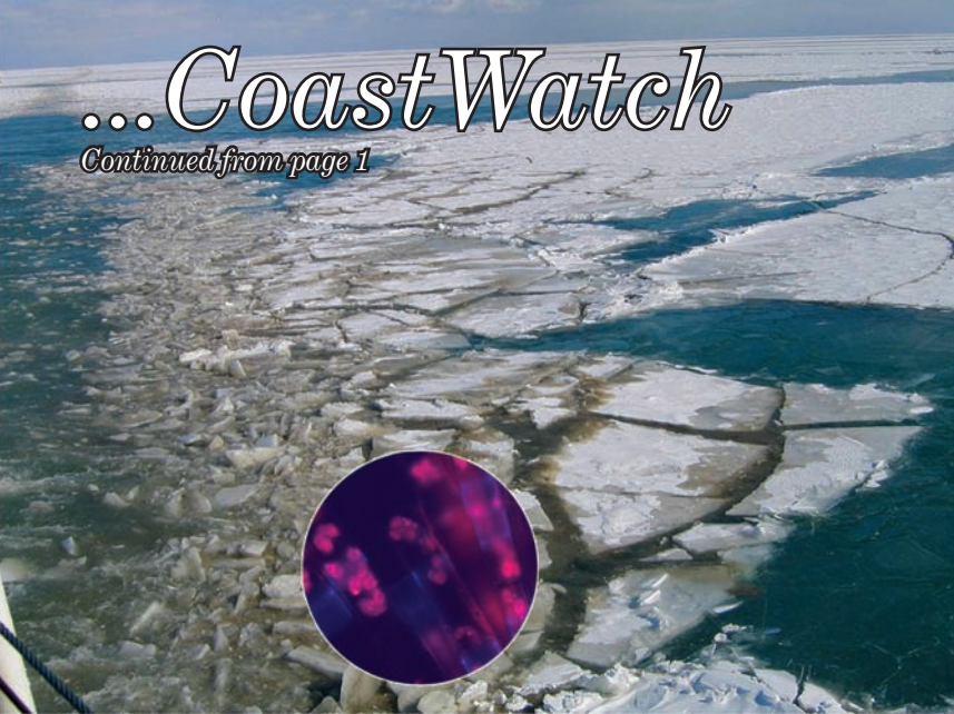
Productivity in Lake Erie is greater in winter than in summer. The Coast Guard cutter reveals streaks of brownish silt containing filamentous diatoms as it cuts through lake ice.