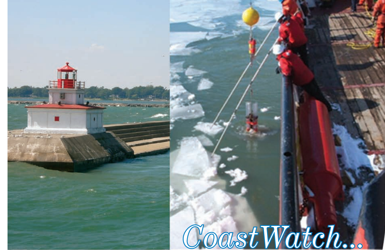
Lake Erie – a sentinel for climate change. A breakwater on Lake Erie (left) protects the shore near Buffalo. Researchers sample Lake Erie in winter aboard the Canadian Coast Guard Cutter Griffon.