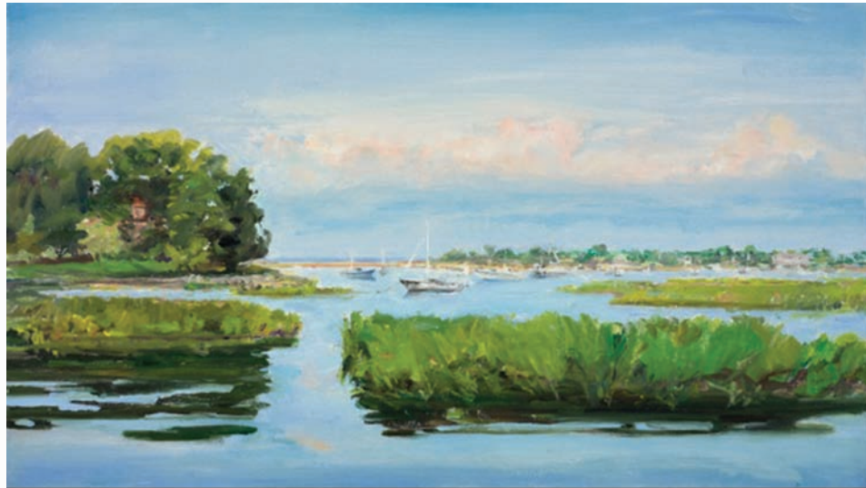
Mount Sinai Harbor on Long Island's north shore, one of 50 Long Island Sound embayments being studied for the risk of eutrophication in a newly-funded research project. Oil painting and photo by Joan Branca